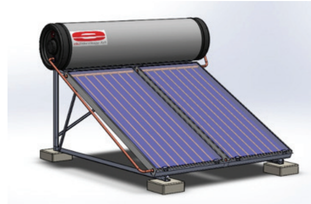
300 liters model